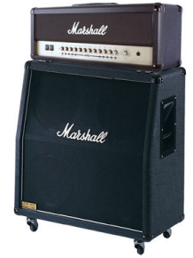
GUITAR AMPLIFIER Marshall JMD 50w Marshall 1960A (4x12") 300W