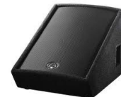
Monitor (lead vocal)