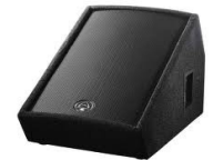
Monitor (brass section)