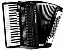
ACCORDEON (will bring own DI-box)