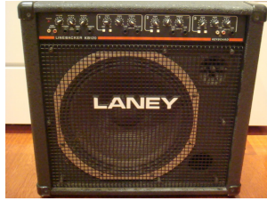
ACCORDION AMPLIFIER Laney Linebacker 65W 1x12"