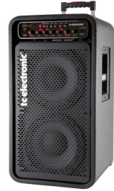
BASS AMPLIFIER TC Electronic Combo 750W (DI-available)