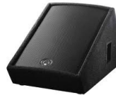
Monitor (accordion - optional)